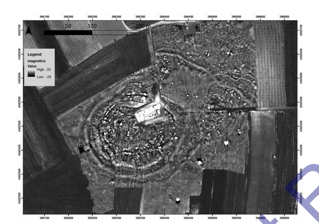
Fig. 3. Magoula Rizomilos 2. Results of the magnetic survey superimposed on a GeoEye-1 satellite image taken on May 4, 2010. The satellite image is a pansharpened Intensity-Hue-Saturation combination. A second smaller similar tell is suggested to the east of the settlement. To the north, the magnetic signature and the satellite data indicate traces of past flooding activity. According to the locals, the region used to be flooded regularly in historical periods.

Rondiri 2004: 24–38), diverse usage was demonstrated on the mound, which was roughly 50 m in diameter. The clustered dwellings were clearly separated by an open/empty zone. In some cases, the nucleus of the tells was surrounded by small enclosures and the limits of the settlements were defined by a larger system of outer multiple ditches, usually of circular shape, all of which bear evidence of multiple entrances. At Almyros 2, an unoccupied area was identified between the nucleus of the tell and the outer ditches to the north, contrasting with the southern part, which seems to have been densely occupied (Fig. 1).